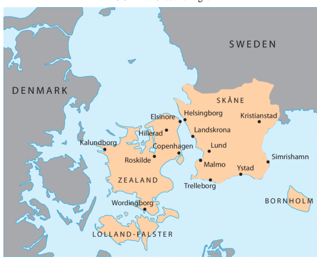
FIGURE 1: Öresund region

The Öresund "region" labels the land areas surrounding the Öresund strait, which constitutes the border between Sweden and Denmark. It covers an area of 20.859 km² and consists of roughly three parts: the metropolitan area of Copenhagen, its suburban area, and Scania (Skåne) on the Swedish side (see Figure 1). However, it is important to note that the term "Öresund region" does not describe an administrative region. as relevant political and administrative powers remain firmly embedded in national structures on either side of the national border. The Öresund region is thus not a functional region in the sense of an integrated labor market.